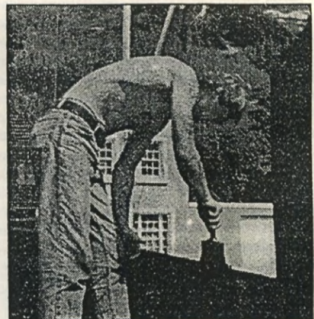
Refurbishing the woodwork