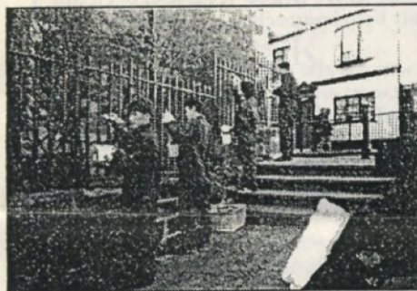
Painting the railings