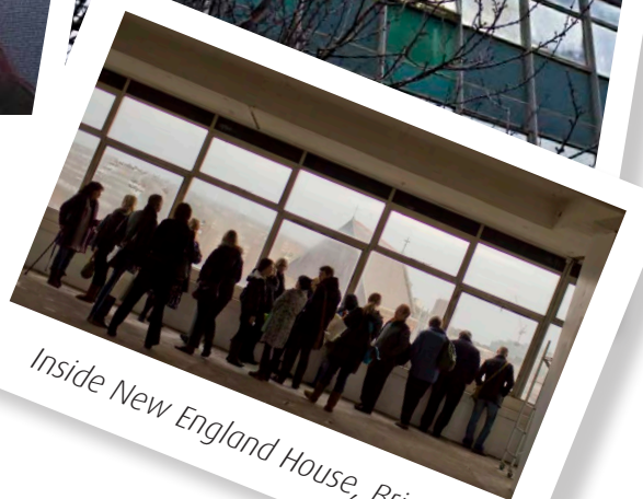
Inside New England House, Brighton

Click on the captions to go to the websites