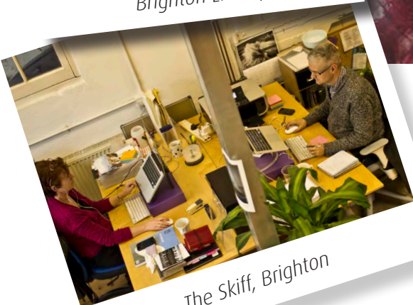
The Skiff, Brighton