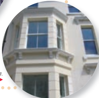
▶ Cambridge Gardens an eco-retrofitted Victorian house finished 2011.