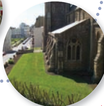
▶ St Mary Magdalen churchyard refurbishment begun 2002.