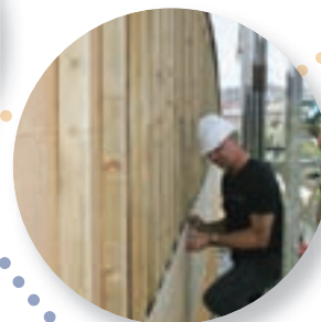
▶ Bridge Centre under construction.