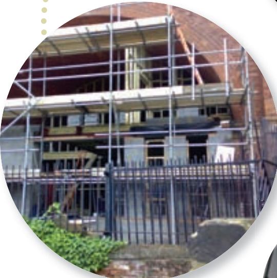
▶ Construction of Linton Road Arches training centre 2007.