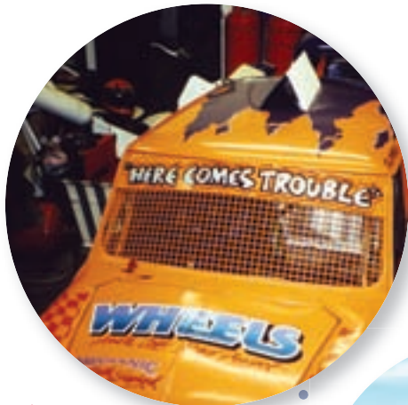
▲ Wheels off the Road project - started November 1996 - gave 11 to 25 year-olds legal access to cars & motorcycles.