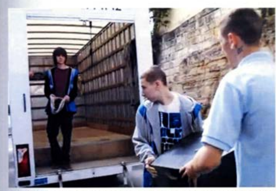
Real practical work was an important part of every placement. Here participants are loading items for an HFS delivery.