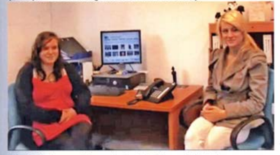
Watch the Learn video made by Entertainment Workshops: www.hfs.org.uk/learn.html