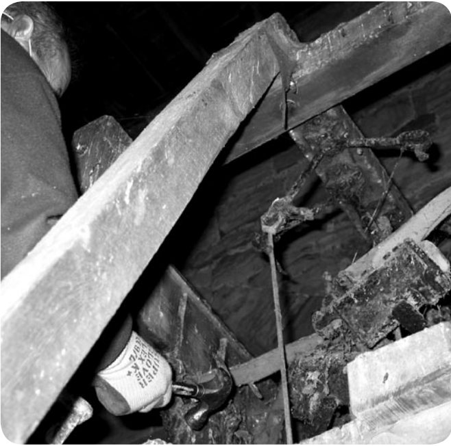
Volunteer beginning work

Winter can be the most uninspiring period of the gardening year so to muster enthusiasm amid the dulllest coldest season is testing for the best of us. However, it is ideally suited for taking stock and charting our progress from one year to the next.