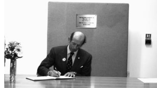
Official opening by the Duke of Kent

The 7th April Spring event showed English Partnerships that how well we knew our own community: we ensured they paid the people providing entertainment and used small local businesses to advertise, decorate and clean.