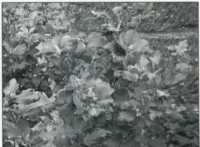
A late flowering Hibiscus blooming in October