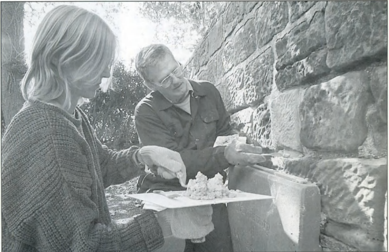
Volunteers re-pointing following the insertion of a hand cut piece of stone.