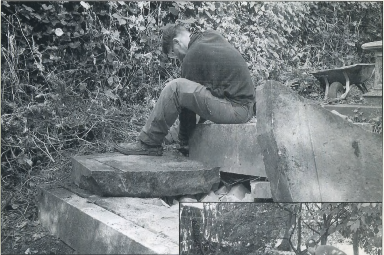
Volunteers hard at work within Wallinger's Graveyard