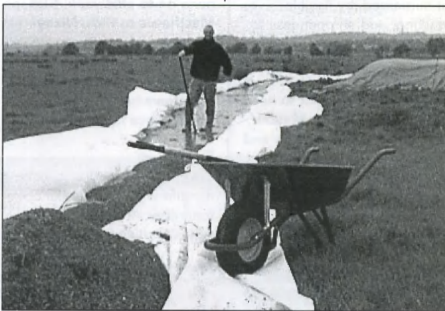
Ground water lowering at Combe haven

Enquiries to 437049 or tcl@buildingdivision.com